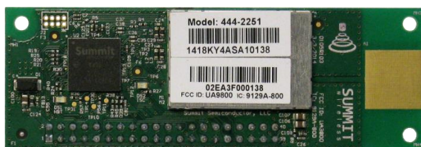
Summit SD TX Module Top View

The Summit Standard Distance Transmitter is designed to connect directly to the main host application board through a 2x20, 100 mil standard header. Digital audio is input via an I 2 S data interface. The board is powered by 1.2 VDC and 3.3 VDC, sourced from the host application board. Control of the Summit Transmit Module is accomplished through an I 2 C interface. Summit firmware updates are supported via the UART and I2C interfaces.