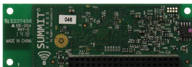
Summit SD TX Module Bottom View