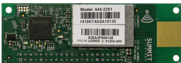
Summit SD TX Module Top View

The Summit Standard Distance Transmitter is designed to connect directly to the main host application board through a 2x20, 100 mil standard header. Digital audio is input via an I 2 S data interface. The board is powered by 1.2 VDC and 3.3 VDC, sourced from the host application board. Control of the Summit Transmit Module is accomplished through an I 2 C interface. Summit firmware updates are supported via the UART and I2C interfaces.